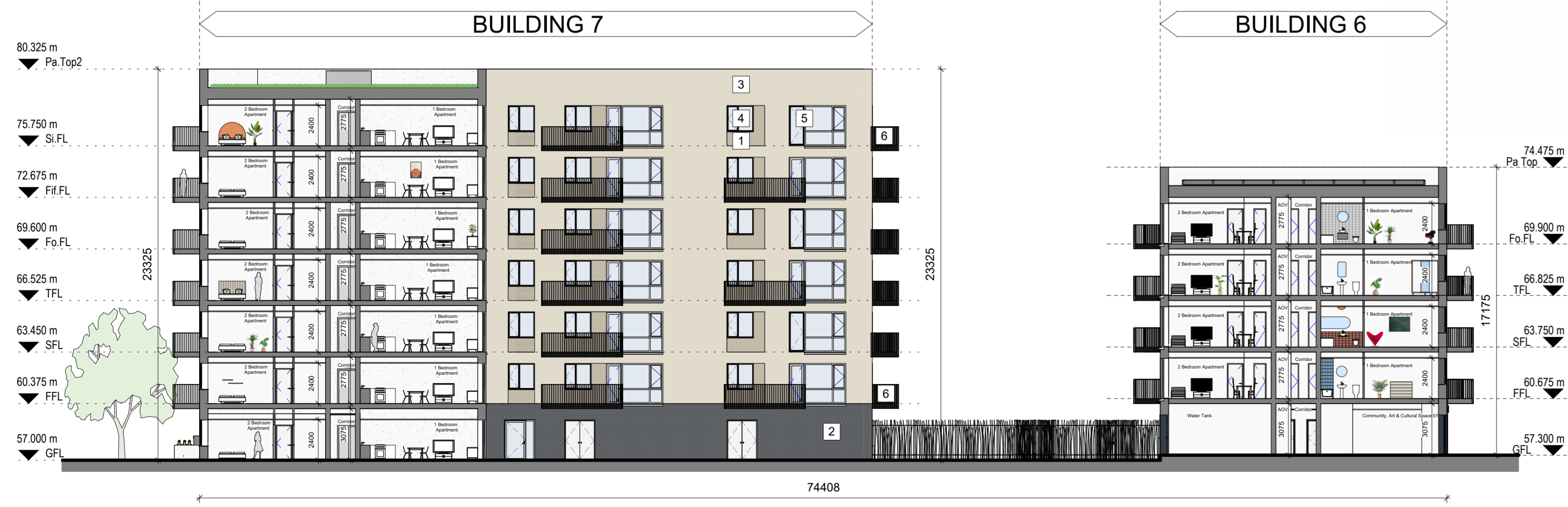
2 Section B-B 1 : 200

All works to be carried out using proper materials which are fit for the use they are intended and for the condition in which they are to be used. All materials used in connection with the works to comply with the Construction Products Regulation (EU) No. 305/2011 and the harmonised technical specifications/standards that fall within the remit of the CPR No. 305/2011. Figure dimensions must be used in preference to scaled dimensions. Any dimensional discrepancies must be reported to the Architect immediately. This drawing remains the copyright of van Dijk Architects. It must not be used for any purpose building or otherwise without the express permission of this practice. Do not copy or redistribute these drawings or any additional information without the expressed approval of van Dijk Architects.